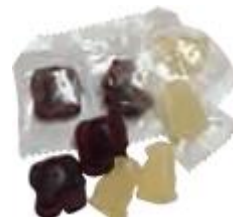
Candies Gummy Candies